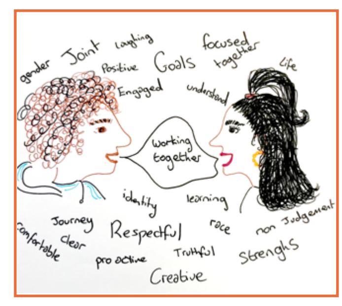
Coproduced by JD and YB as part of their Reparation-10/06/2019