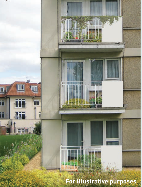
A before and after showing improvements to the balconies