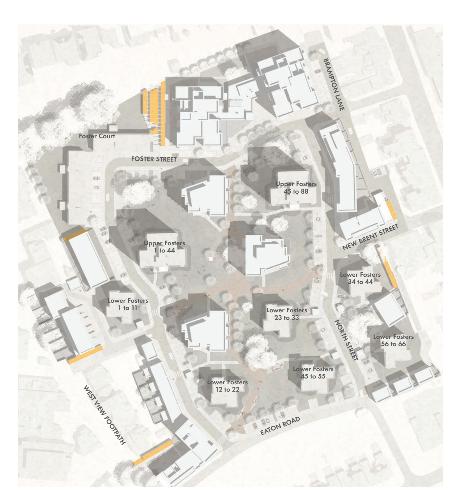
The location of storage units

The 76 garages on the estate are primarily in poor condition, with only 22% rented by estate residents. In addition, you told us the garages create places for antisocial behaviour. In line with your feedback, the garages will be demolished to make space for new homes and landscape improvements.