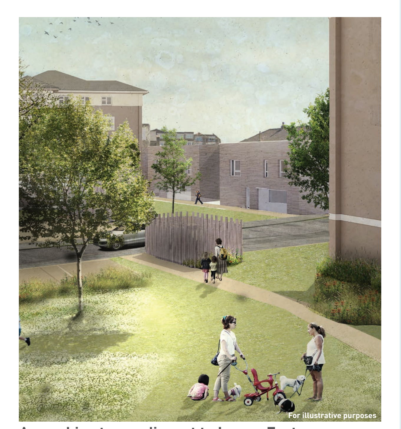
A new bin store adjacent to Lower Fosters