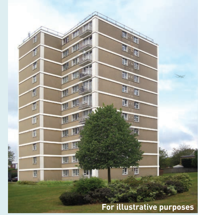
A before and after showing painting of the building's trim