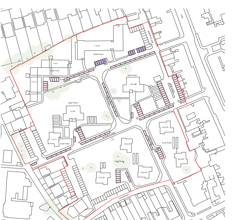
Existing car parking spaces on the estate.