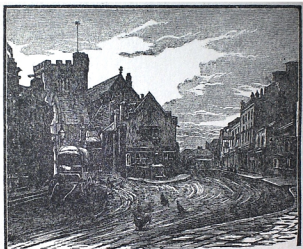
BARNET HIGH STREET BEFORE THE DEMOLITION OF "MIDDLE ROW."