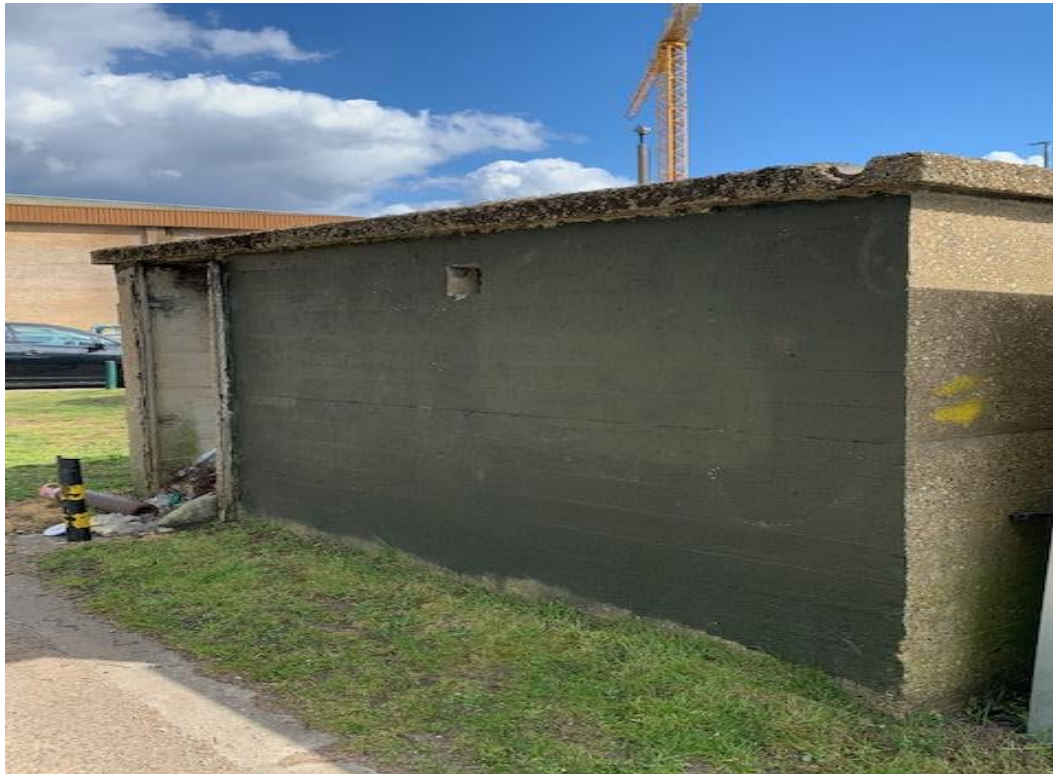
Front of post