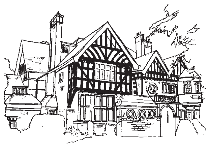
Bishop's Mead (now Leo Baeck House), 1900 in Neo-Jacobean style.

5.4 Zone 4 Zone 4 includes all the locally listed properties running from Hampstead Lane to Kenstead Hall. The zone includes the straight, strong entrance to The Bishop's Avenue and runs along the first bend. Many houses in this zone are of a high quality in the vernacular style. As a group they can be described as organic and generally on a human scale. This is in part due to the generally domestic scale of doors, windows and other building components.