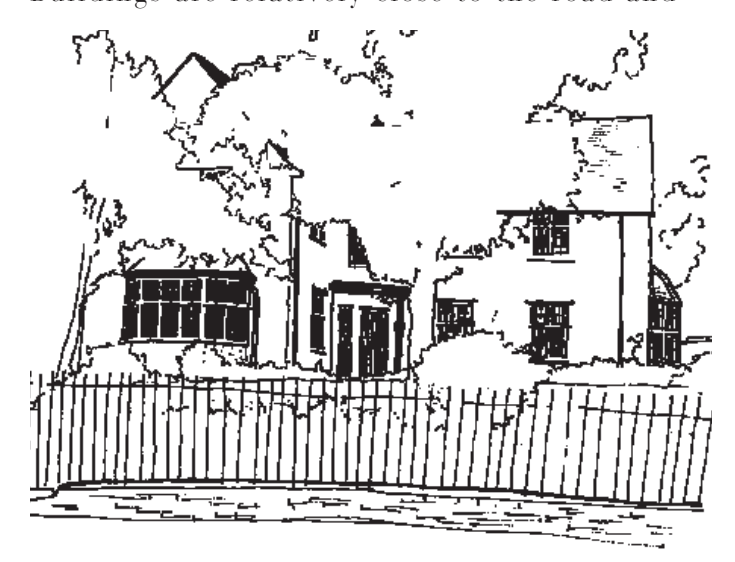
10 The Bishop's Avenue, 1914-15, by G L Sutcliffe for the Hampstead Garden Suburb Trust

5.1 Zone 1 This includes the level section of the road running towards and across Lyttleton Road. Houses tend to be more modest than those in zones 2 and 4 and sit within smaller plots. Buildings are relatively close to the road and