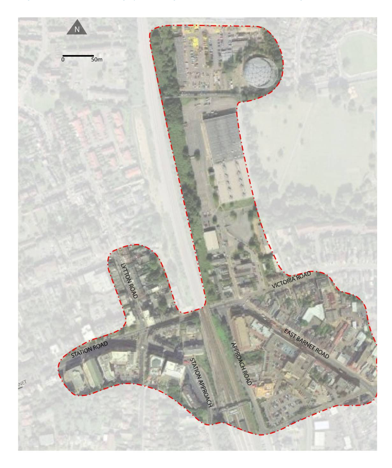
Figure 1.1 Aerial Photograph Showing Framework Area and Surroundings

The scenarios/options are supplemented by further detailed guidance on transport, urban design, and sustainability which are set out in the full report.